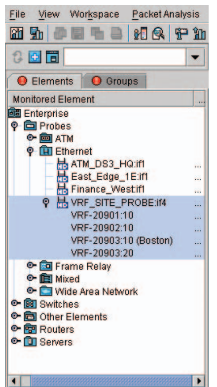
Figure 2: VRFs identified by the nGenius Probe from BGP updates are represented for tracking using the individual VRFs.

Service Providers want and really need visibility into their MPLS traffic flows for a variety of reasons. Competition is fierce, particularly given the nature of a subscription service. Should a Fortune 1000 or Global 2000 customer become dissatisfied with the service quality of an existing provider, contracting with another is a very manageable alternative.